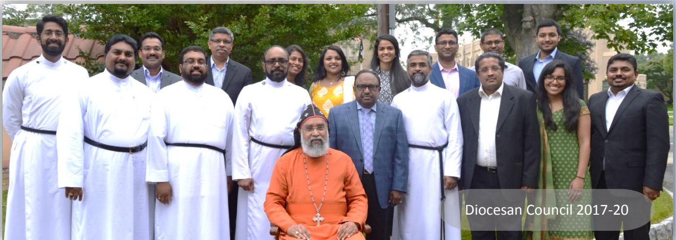
Diocesan Council 2017-20